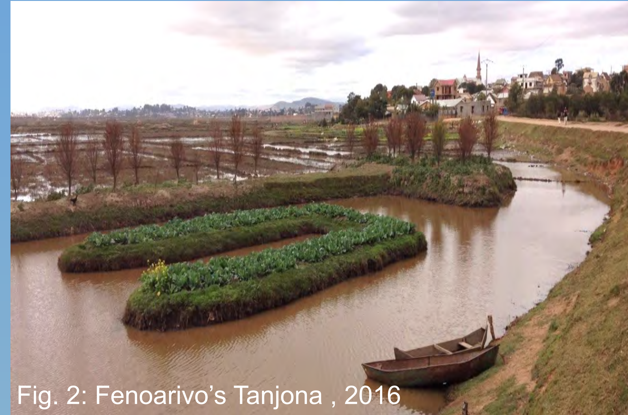
Fig. 2: Fenoarivo's Tanjona, 2016