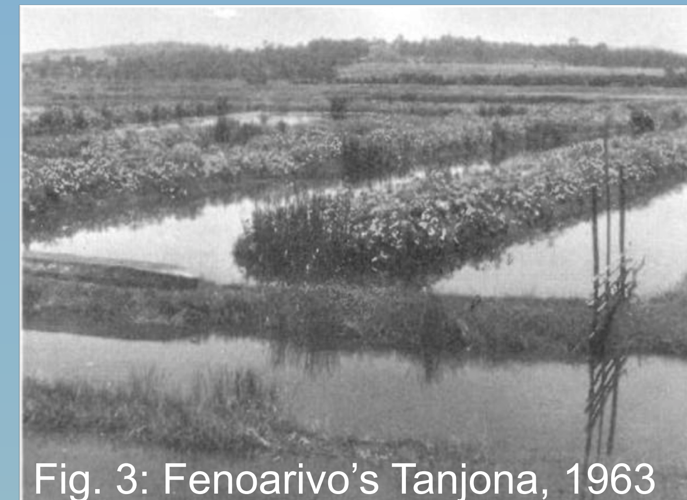
Fig. 3: Fenoarivo's Tanjona, 1963