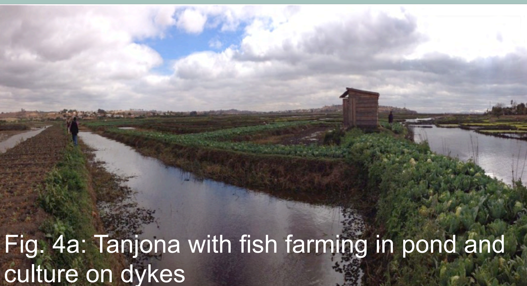
Fig. 4a: Tanjona with fish farming in pond and culture on dykes